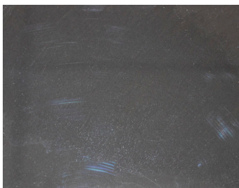
Sani-HyPerCide (Clear Polycarbonate)

As Sani-HyPerCide disinfectant is a hydrogen peroxide formula, it does not undergo the same phenomenon.