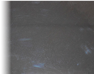
Sani-HyPerCide (Clear Polycarbonate)