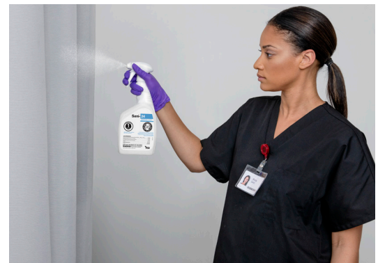
Soft surface sanitization

Enterobacter aerogenes Enterococcus faecalis VRE (Vancomycin resistant enterococcus) Pseudomonas aeruginosa Staphylococcus aureus Staphylococcus aureus (Methicillin Resistant) (MRSA)