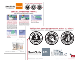
Instructions for Use Signage (bilingual)