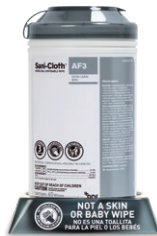
Sani-Canister Caddy® for placement on flat surfaces (bilingual)