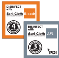
Sani-TAG™ Equipment ID System for identification of equipment to ensure the proper wipe is used on a particular piece of equipment