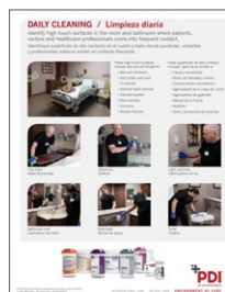
Daily Cleaning Wall Chart (bilingual)