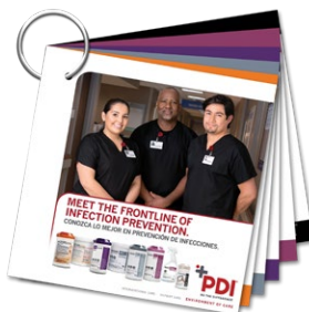
Quick Reference Guide (bilingual)