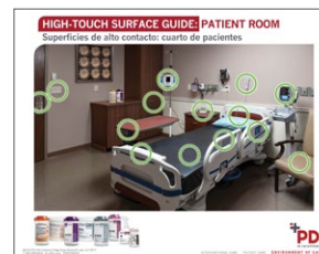
High-Touch Surface Guide (bilingual)